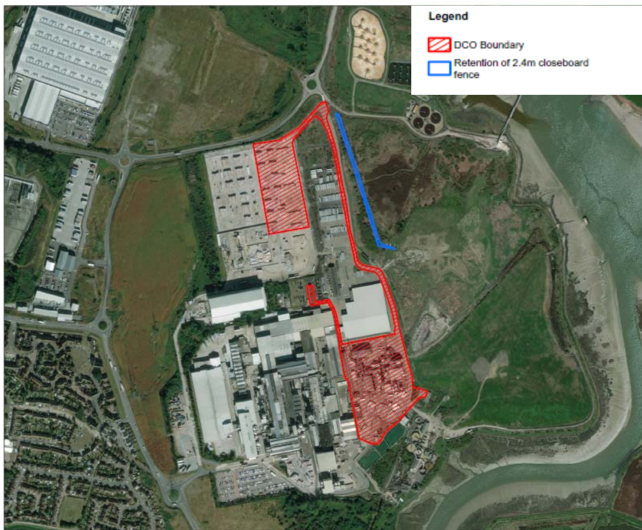
Figure 1: Close-board fence to be retained/reinstated for construction of K4.